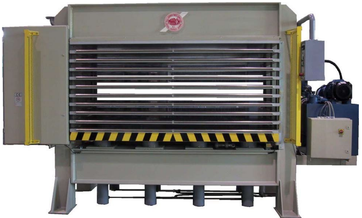
PHH 2714-10 MODEL

The number of jobs opening will be adjusted according to the needs of our customers.